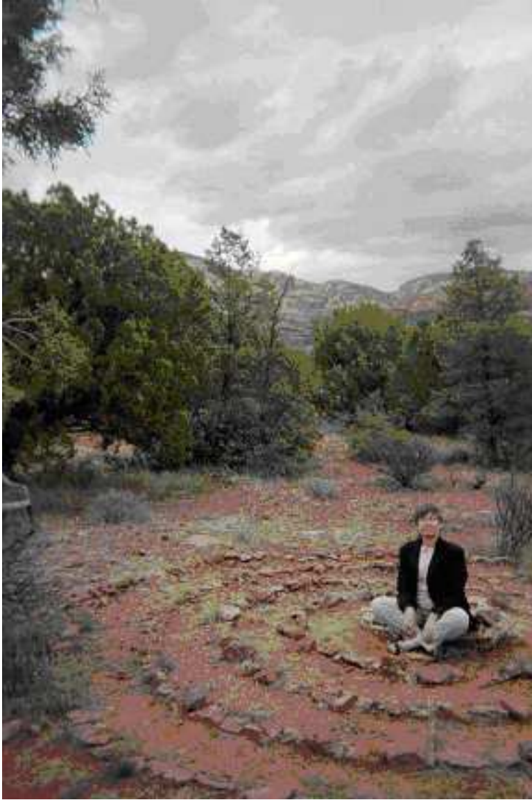
Sitting in the middle of a vortex.