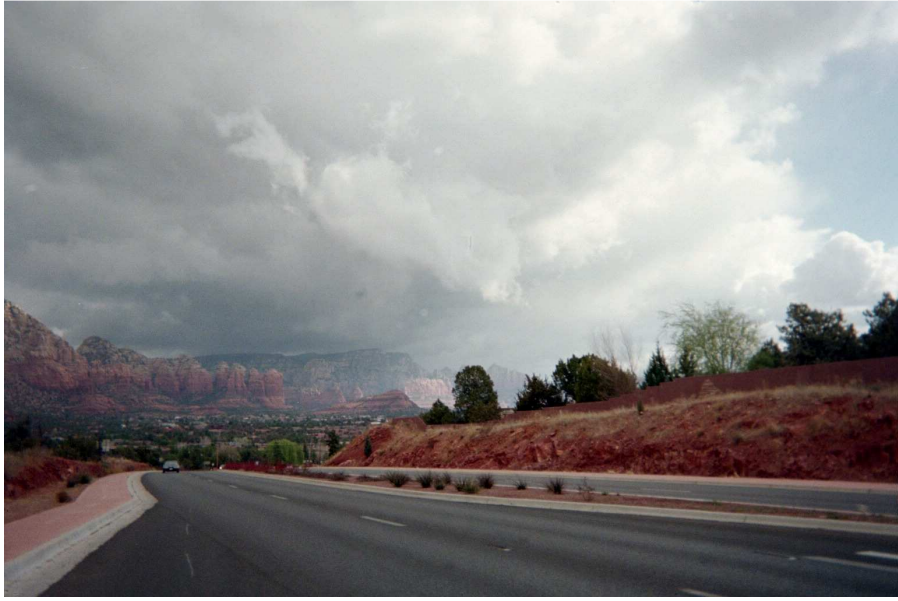
Looking back towards West Sedona as I head towards Cottonwood.